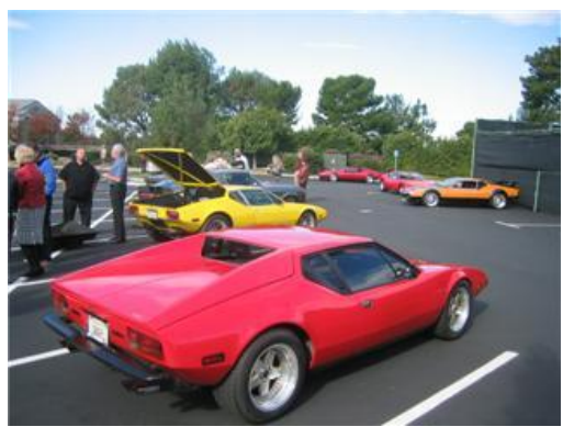
Parking lot show