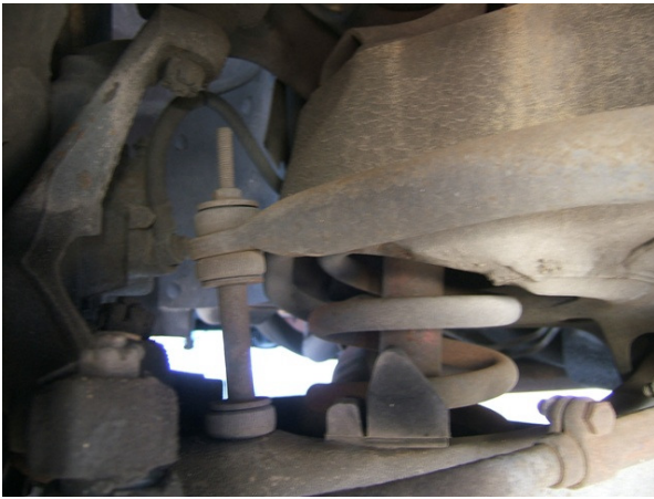
Sway bar link on my old Safari