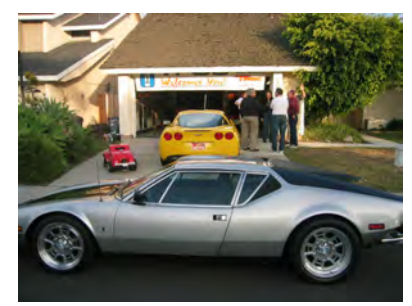
Prior SuperBowl at Dave's