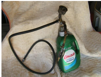
Pressure Tank Kit