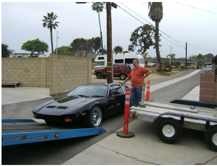
Where is the key?