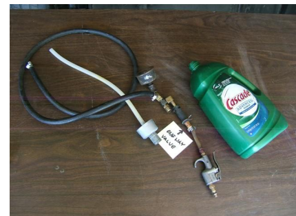
Shows One-way Valve

The above picture shows the 2.5 inch hole yet to be covered with a plastic furniture cover or metal plate. Tommy insisted that this is unwarranted nevertheless we were not able to make it happen without the access.