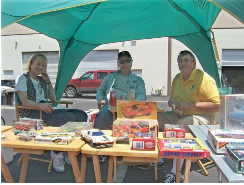
2008 Swap meet sellers at Bud's