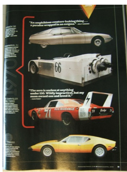
On list of 51 coolest in 50 years