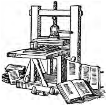
Start the presses