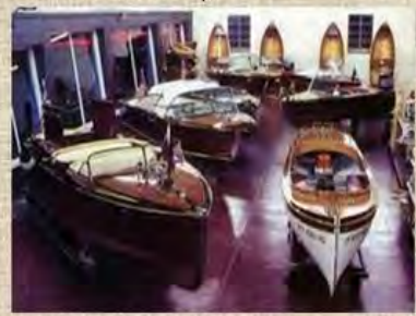
Sierra Boat Works Tour

The 2023 Fun Rally will feature a variety of attractions around Reno and Lake Tahoe for all attendees beginning with Scenic Drives, Car Show, Tech Sessions (ZF Transmission/Electrical). The traditional Hospitality Suite (3 drink tickets per day included) will feature vendor displays, the POCA 50/50 raffle run by Joe Russo and a Plated Banquet Dinner with guest speaker Les Gray (5 time POCA President).