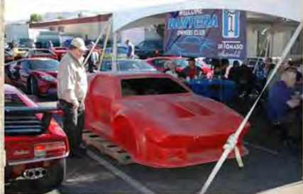
Pantera Parts Connection Morning Breakfast