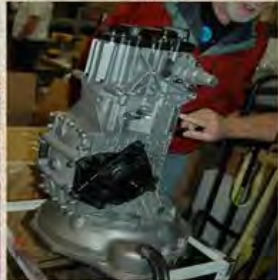
ZF Tech Session