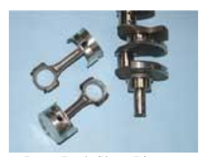
Long Rod, Short Piston