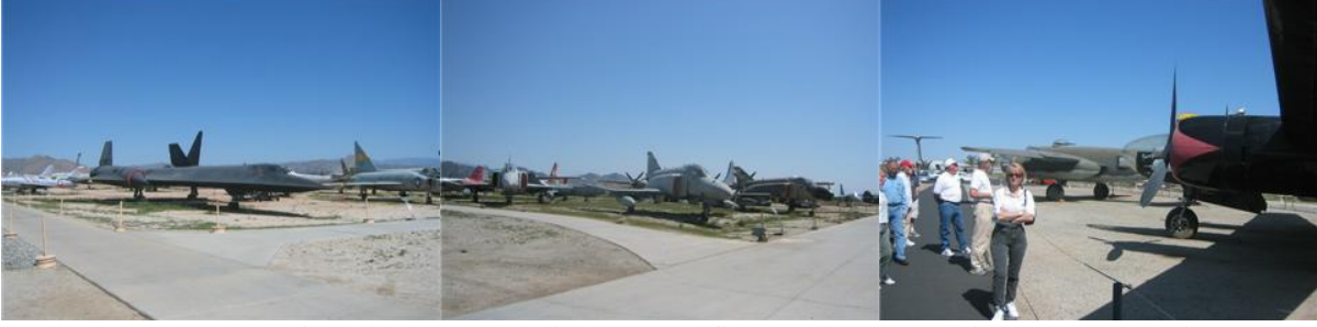
SR71 Fastest production plane

While getting the Panteras out on the road for a little exercise is fun all on its own, the March Field Museum, with its tens of thousands of historical artifacts, is a fascinating destination and well worth the drive.