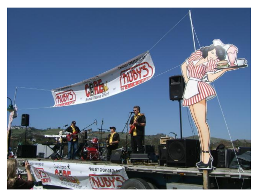
Rock n Roll Band