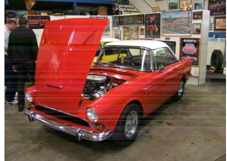
Ready to Go!!!!!