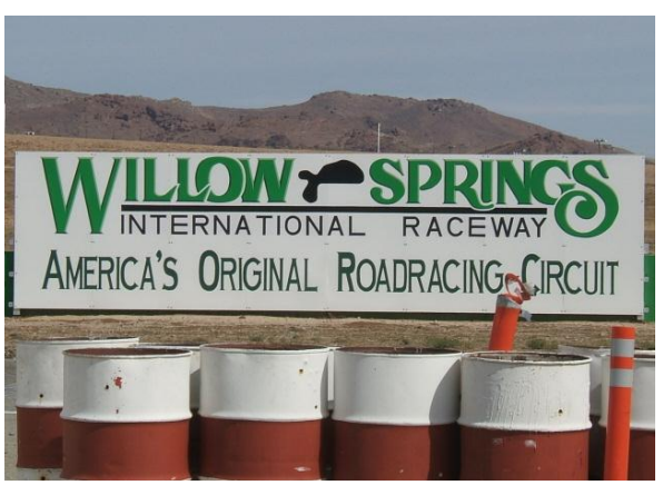
Willow Springs Track