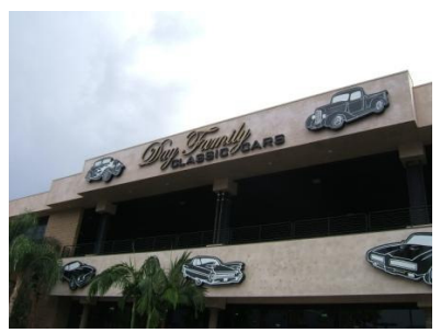
Day Family Museum