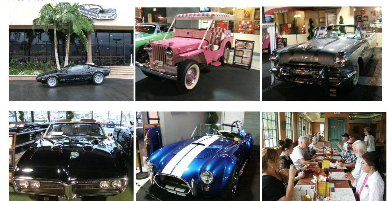
Gang picture