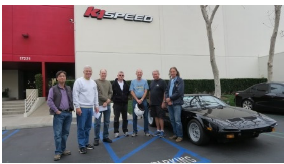
Kl Speed GoCarts January 23, 2016