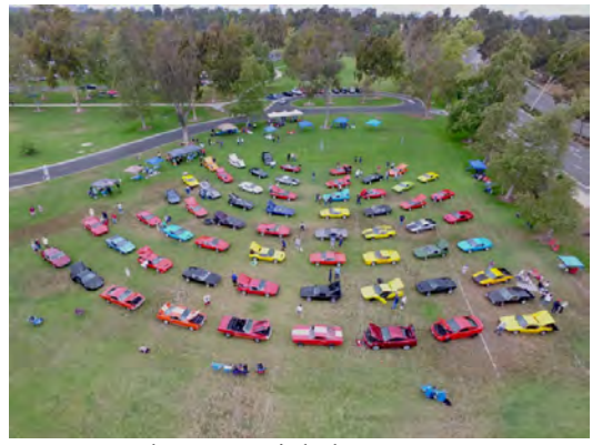
Palooza Aerial shot