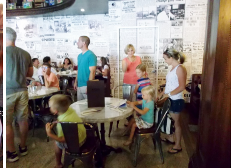
The real kids