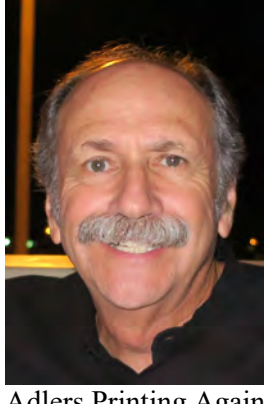
Adlers Printing Again