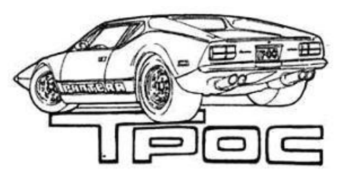
More at www.ocPanteras.com