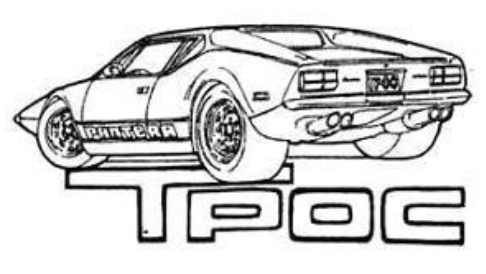
More at <u>www.ocPanteras.com</u>