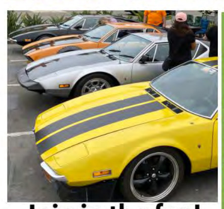
Join in the fun! Ocean Breeze, Candy & Outdoors Safe!