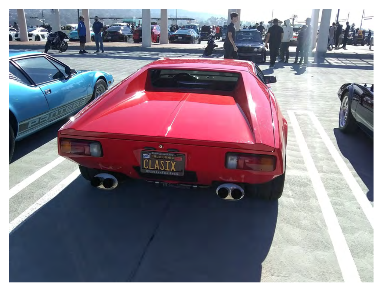
We had 27 Panteras! 10 from San Diego chapter.

Calendar is still working on current events.