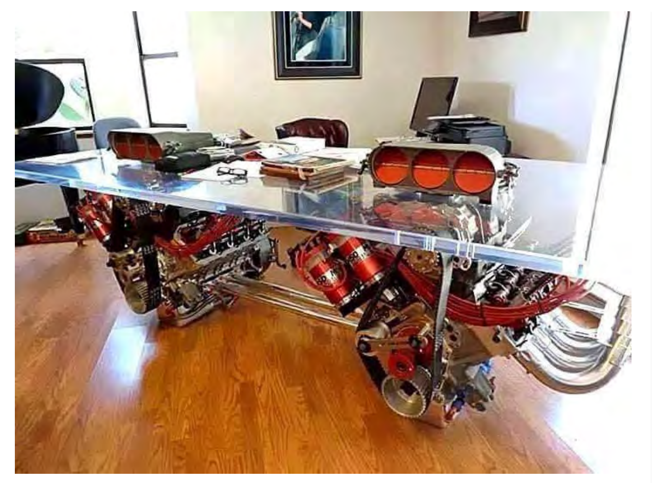
Sometimes you need to make Quick business decisions!