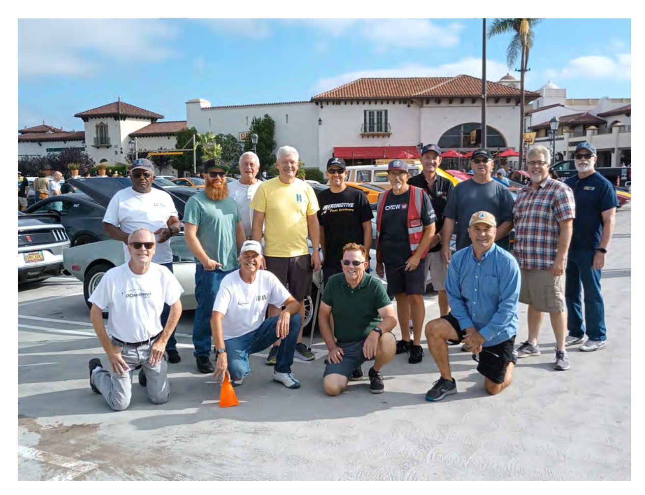
We had a good turnout for our Drive Your Pantera Day meetup. About a dozen Panteras and a great morning event!