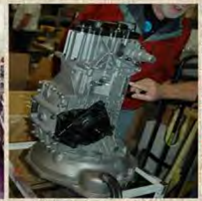
ZF Tech Session