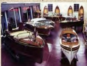
Sierra Boat Works Tour

The 2023 Fun Rally will feature a variety of attractions around Reno and Lake Tahoe for all attendees beginning with Scenic Drives, Car Show, Tech Sessions (ZF Transmission/Electrical). The traditional Hospitality Suite (3 drink tickets per day included) will feature vendor displays, the POCA 50/50 raffle run by Joe Russo and a Plated Banquet Dinner with guest speaker Les Gray (5 time POCA President).