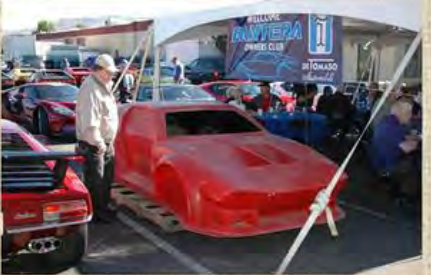
Pantera Parts Connection Morning Breakfast